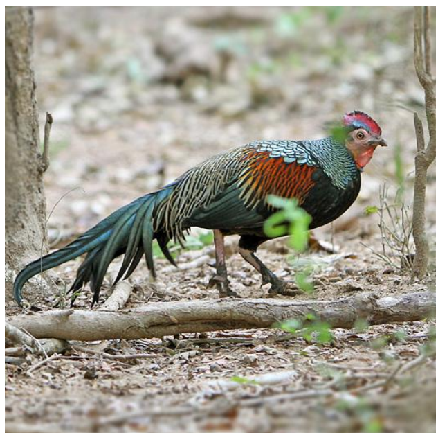
Flores Hawk Eagle and Flores Monarch (top) Bare-throated Whistler and Moluccan Scops Owl (middle) Barred Dove and Green Junglefowl (bottom)