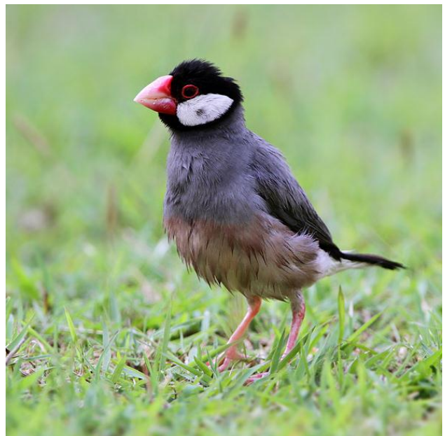
White-tailed Tropicbird and Java Sparrow, Bali

For information regarding our scheduled tours to the Lesser Sundas please click here . Alternatively please contact us via e-mail regarding organising a custom tour to the Lesser Sundas or elsewhere in Indonesia.