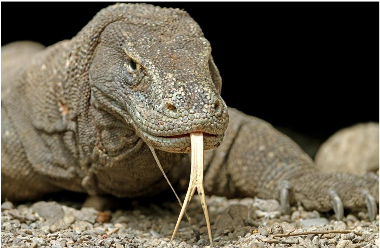
Komodo Dragon, Komodo