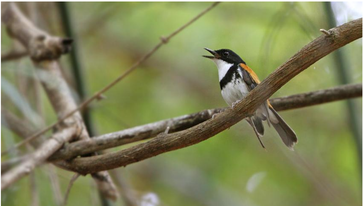
Black-banded Flycatcher, Timor