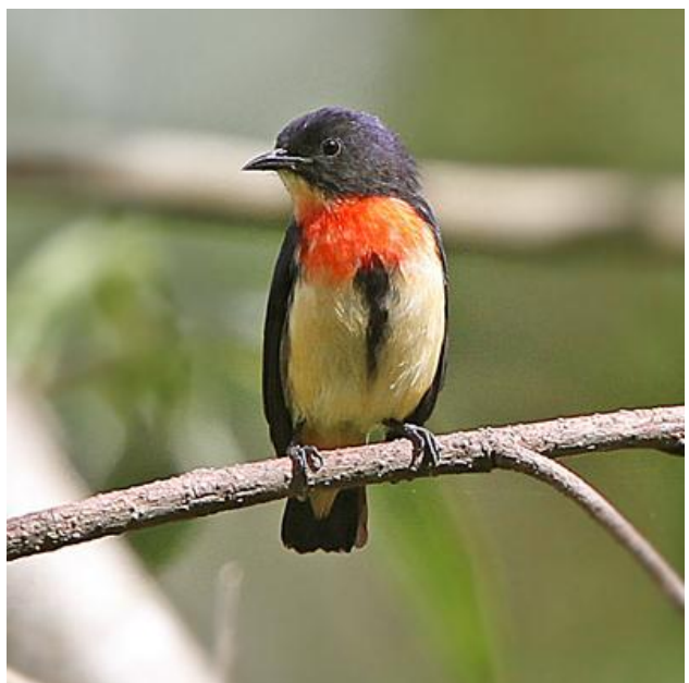
Flores Crow and Wallace's Hanging Parrot (top) Brown-capped Fantail and Flores Minivet (middle) Black-chested Flowerpecker and Blood-breasted Flowerpecker (bottom)