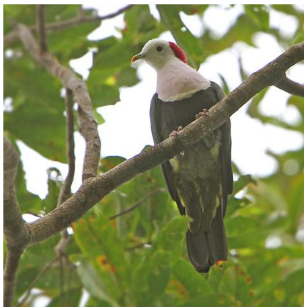
Sumba Boobook and Red-naped Fruit Dove, Sumba

With one glaring omission from yesterday's haul, we decided to visit to different forest patch, well away from the busy road and requiring a decent pre-dawn walk. An array of parrots performed for us from our vantage point looking over the forest; Marigold Lorikeet, Great-billed and Eclectus Parrot, along with Rusty-breasted Cuckoo, agitated Broad-billed Flycatchers, good numbers of Red-naped Fruit Dove, frustratingly for all except Brian the only Sumba Green Pigeon of the trip. After keep us in suspense for a couple of hours a female Sumba Hornbill flying over the ridge, landing on several different perches as it ridge-hopped. Waiting a while longer, a male came from where the female went, perching up for almost over-kill.