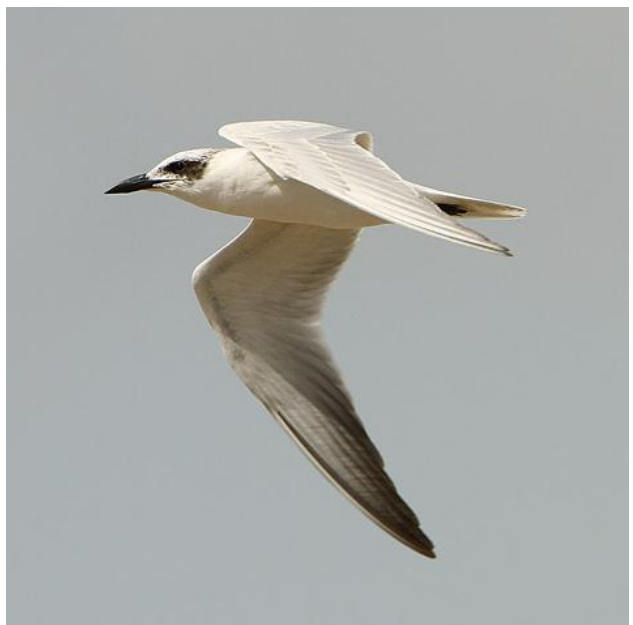
Streak-breasted Honeyeater and Spot-breasted Dark-eye (top) Northern Fantail and Timor Stubtail (middle) Oriental Honey Buzzard and macrotarsa Gull-billed Tern (bottom)