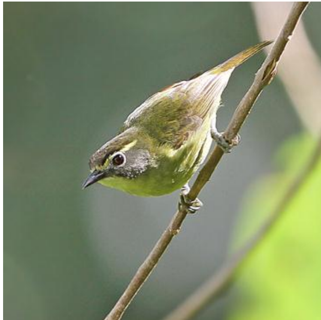
Crested Dark-eye and Yellow-browed Dark-eye, Flores

Typically, having put in considerable effort to find perched Flores Lorikeets around Ruteng, we found a pair feeding almost as soon as we had given up and left for our next destination, Labuanbajo. Not only that, but an hour later we found large numbers feeding on some bottlebrush , below the road, numbering well over 50, and probably many, many more!