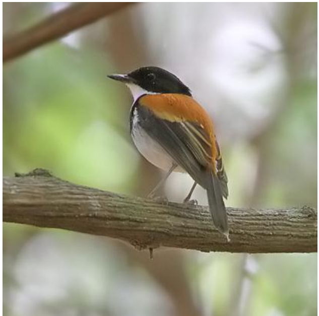
Olive-headed Lorikeet, Timor and Great-billed Parrot, Sumba (top) Bar-necked Cuckoo Dove and Black-chested Myzomela (middle) Timor Sparrow and Black-banded Flycatcher (bottom)