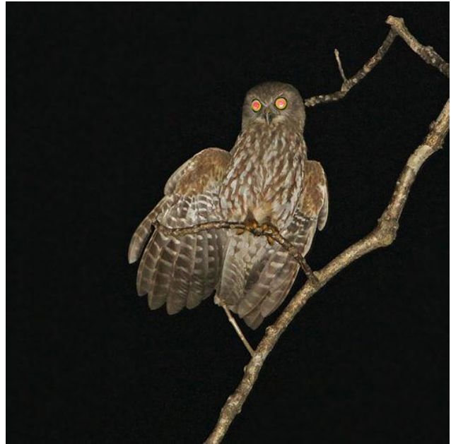
Pygmy Wren Babbler and Timor Boobook, Timor

As we headed back to Timor's coastal capital, Kupang, a stop at Camplong was required for one glaring omission in most of our list – Timor Stubtail. Somehow this bird had managed to remain unseen to most of us for the past few days. Funnily enough, walking up the same track as the previous day and stopping the moment we heard one (they are relatively common by voice!), we stopped, waited and enjoyed point-blank views of it hopping through the mid-storey in front of us, before chasing-off an intruder! This meant an early hot bath, early night and even lie-in for all (except for bird-hungry James!) before departing mid-morning to Flores.