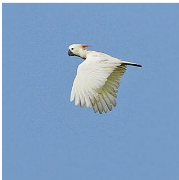
Cinnamon-banded Kingfisher and Sumba Cockatoo, Sumba

With a couple of hours to kill before our late morning flight we headed to a large, forested ravine close to town. Plenty of chatter but not too much except for another Red-naped Fruit Dove, Wallacean Cuckooshrike and Red-cheeked Parrots until, just as we were about to get up and go, a pair of Sumba Hornbill flew-by, then perching up, offering wonderful views in the early morning sunlight, a fitting-end to our wonderful stay on Sumba.