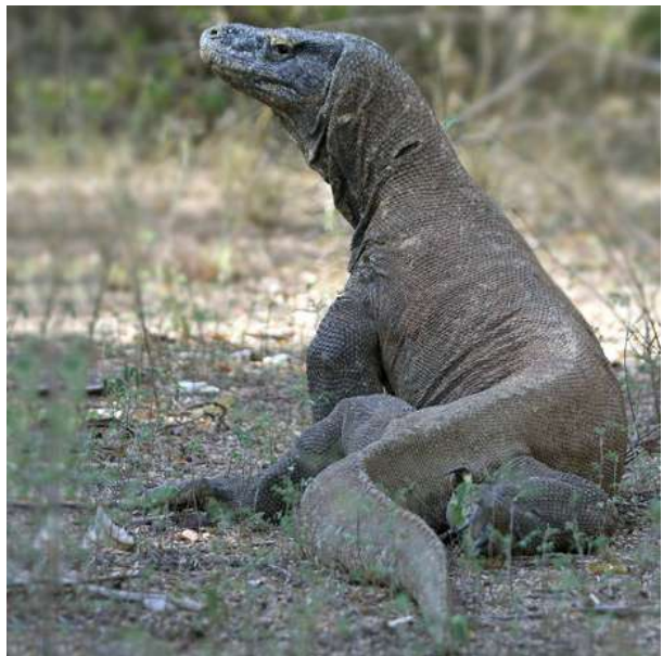
Green Imperial Pigeon and Komodo Dragon, Komodo