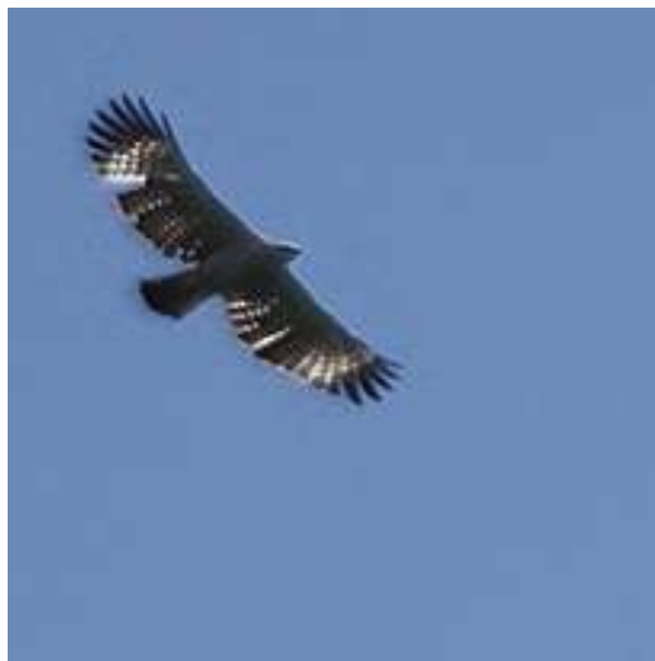
Mees's Nightjar and Flores Hawk Eagle, Flores