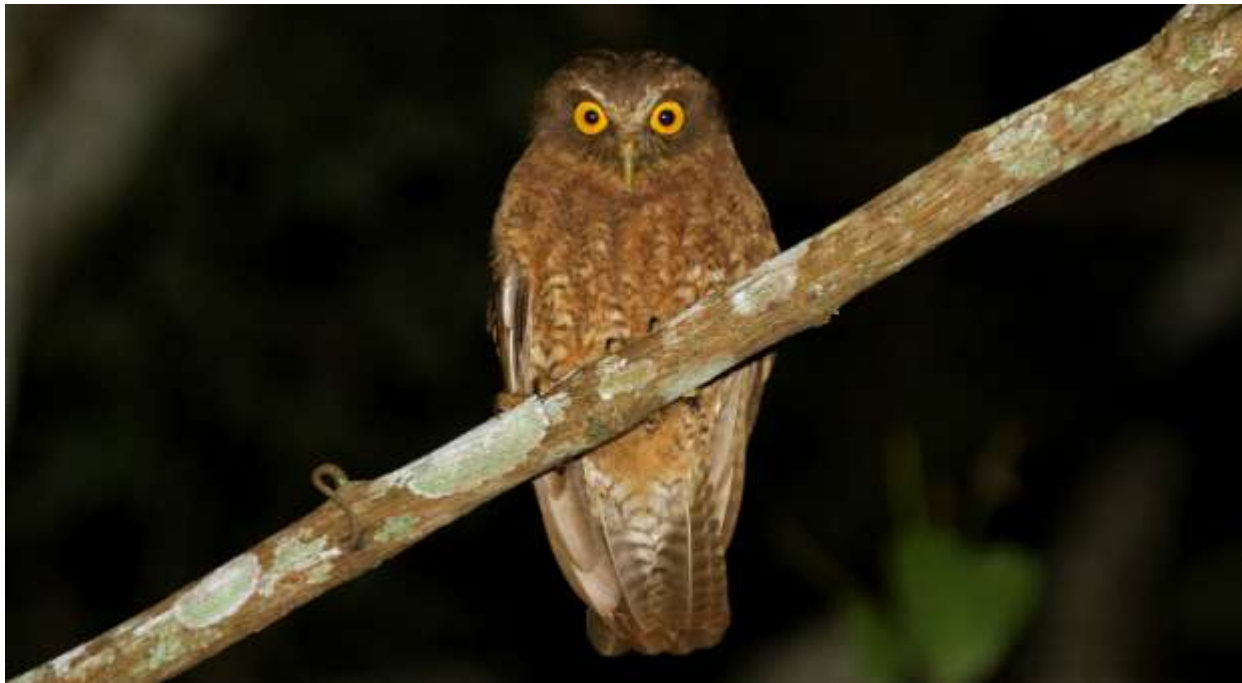
Little Sumba Boobook, Sumba