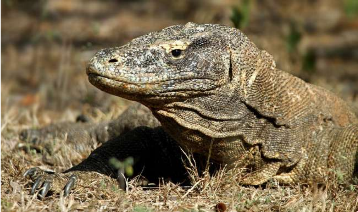
Komodo Dragon, Komodo