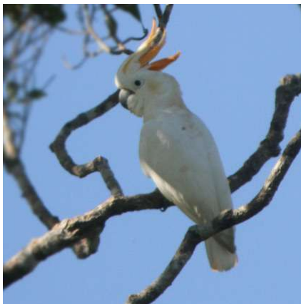
Chestnut-backed Thrush and Sumba Cockatoo, Sumba