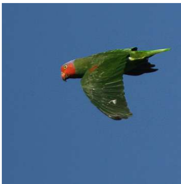
Black-backed Fruit Dove and Red-cheeked Parrot