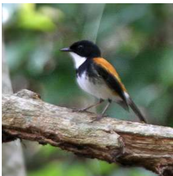
Timor Black Pigeon and Black-banded Flycatcher, Timor