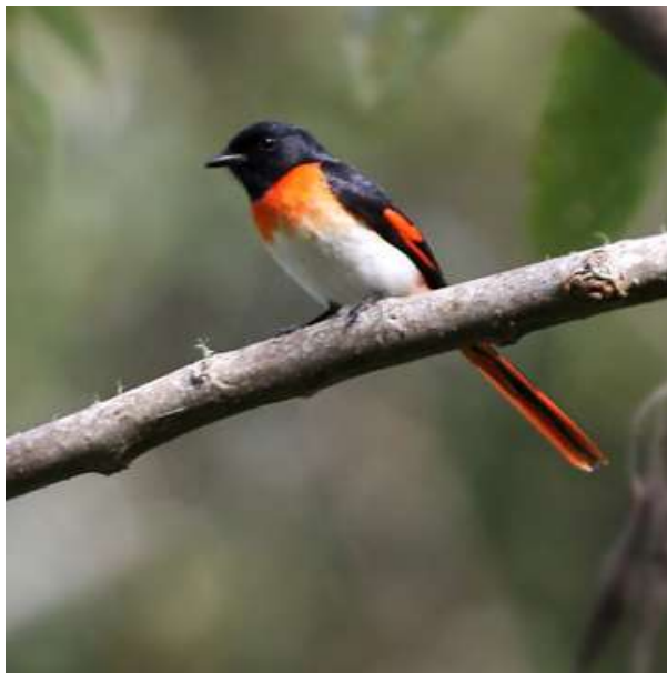
Yellow-crested Cockatoo, Timor and Flores Minivet, Flores