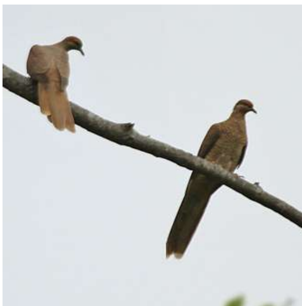
Timor Boobook and Timor Cuckoo Dove, Timor