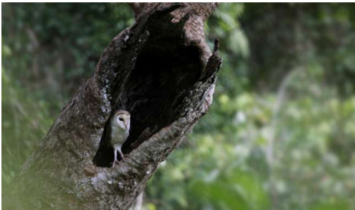
Barn Owl, Sumba