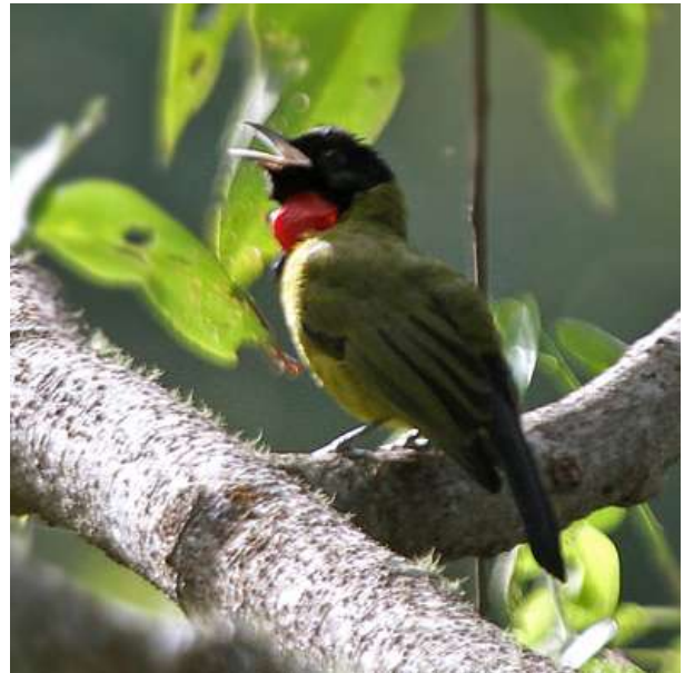
Flores Green Pigeon and Bare-throated Whistler, Flores