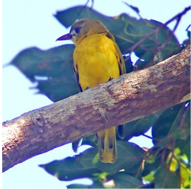
Northern Sooty Woodpecker and White-lored Oriole, Subic Bay, Luzon

For further information on Birdtour Asia tours to the Philippines please contact us via our e-mail or click here for our scheduled departure tours.