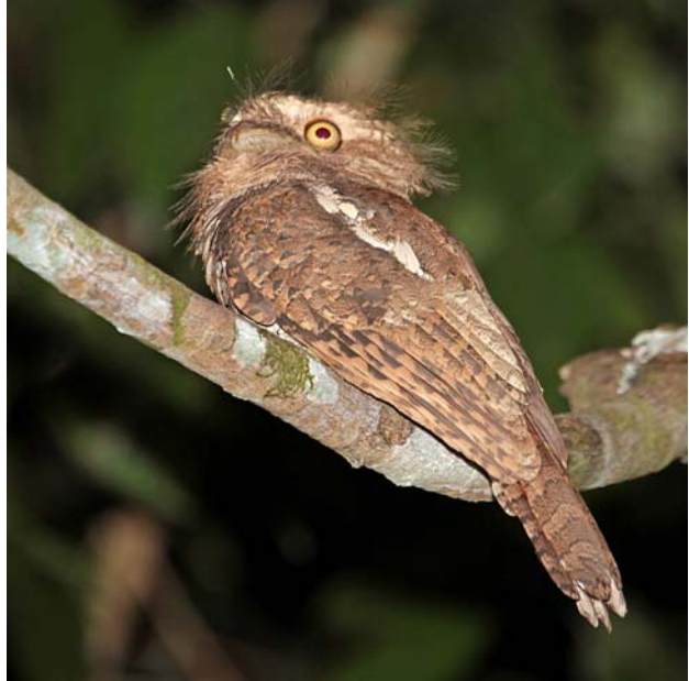
Hooded Pitta and Palawan Frogmouth , Palawan