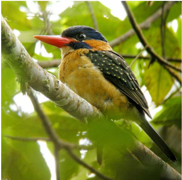
Apo Myna and Blue-capped Wood Kingfisher, Mount Kitanglad, Mindanao

Our first morning began before dawn with a frustrating encounter with a Mindanao Boobook which inexplicably veered away from its intended perch at the last second, leaving us to dream of what might have been. As daylight arrived new birds appeared regularly; firstly a pair of Philippine Trogon, then Buzzing and Pygmy Flowerpeckers, Rusty-crowned Babbler, Mindanao Paradise Flycatcher, Philippine Leafbird, Philippine Green Pigeon, Yellow-breasted Fruit Dove, a very obliging Rufous-ored Kingfisher and a surprise pair of Blue-crowned Racquet-tail – the only encounter of the tour. Moving on to an area of scrappy remnant forest we were rapidly losing hope of laying eyes on an Azure-breasted Pitta calling stubbornly in the impenetrable undergrowth when a second bird nearby came to our rescue with superb views. Just as exciting was a very active feeding flock in the area with more Rusty-crowned Babblers accompanied by Mindanao Pygmy Babblers, and our first Mindanao Drongo, Blue Fantail, Philippine Orioles, Black-chinned Fruit Dove and Black-faced Coucals. Overhead our first Philippine Needletails with their superbly ergonomic wings cause much excitement before we head to a nearby clearing for lunch. Our first Stripe-headed Rhabdornis and showy Rufous-fronted Tailorbirds are found over lunch and when the booming calls of Pink-bellied Imperial Pigeon are heard we head off up the road to secure views of