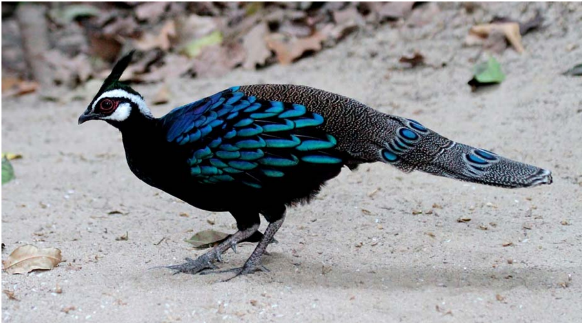
Palawan Peacock Pheasant, St Pauls, Palawan