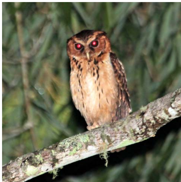
Philippine Frogmouth and Giant Scops Owl, Mount Kitanglad, Mindanao

The next morning the woodcocks again joined us at breakfast before we set off up the mountain soon picking up new birds such as Buff-spotted Flameback (a Greater Flameback split), Elegant Tit, Sulphur-billed Nuthatch, Black-and-cinnamon Fantail, Grey-hooded Sunbird, Olive-capped and Fire-breasted Flowerpeckers, Yellow-bellied Whistler, Tawny Grassbird, Philippine Coucal, our first of several flyover Mindanao Racquet-tails for the day and the often unpredictable White-cheeked Bullfinch. Our primary aim of the day however was to find the national bird of the Philippines – the Philippine Eagle – always one of the major targets of visiting birders, and this group was no exception! Settling at a well positioned viewpoint with views over the extensive forest mountains we set about diligently scanning. Oriental Honey Buzzard of the distinctive philippensis race, Crested Goshawk and Philippine Serpent Eagle were the first to appear, then tantalising glimpses of a huge raptor which is undoubtedly our target but too distant and brief to be sure. Scanning continues until a new white shape appears on the hillside opposite and scopes are swung into action to confirm it as a magnificent Philippine Eagle! Over the next few hours it is in view almost continually as it moved between various perches.