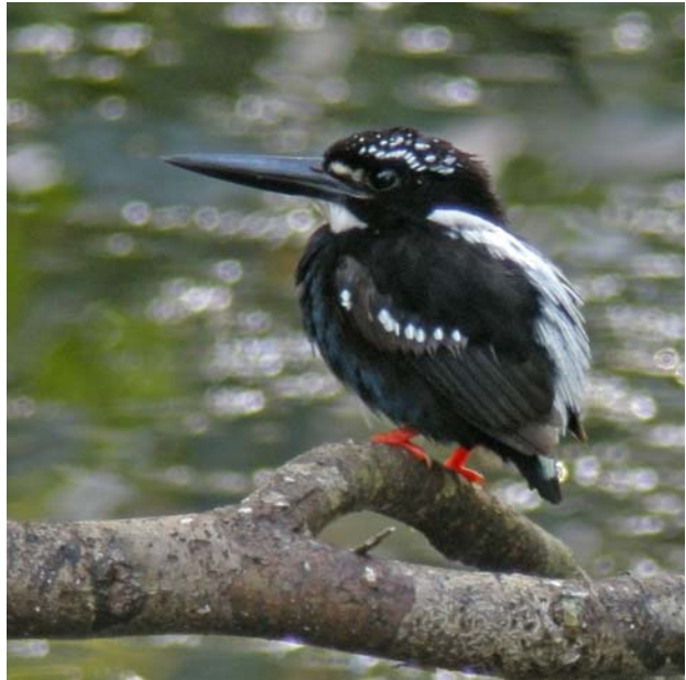
Philippine Fairy Bluebird and Silvery Kingfisher, PICOP, Mindanao