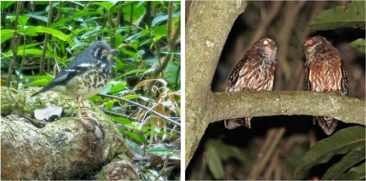
Ashy Thrush and Philippine Boobooks , Mount Makiling, Luzon

The next morning we had a relatively small list of remaining targets but they included one very special bird. We were in place before dawn at a spot where we have recorded Ashy Thrush several times in the past and as light hit the road there was a beautiful marked Ashy Thrush feeding in the half-light! It soon flew off and we thought that was all we would get, but amazingly it soon returned and for the next hour gave increasingly good views in continually improving light, a brilliant performance that fully deserved its accolade as 'bird-of-the-trip'. Luzon Flameback (a recent split from the Greater Flameback complex), another Scale-feathered Malkoha, Sulphur-billed Nuthatch, Philippine Pygmy Woodpeckers and finally dapper Black-and-white Trillers completed our time here.