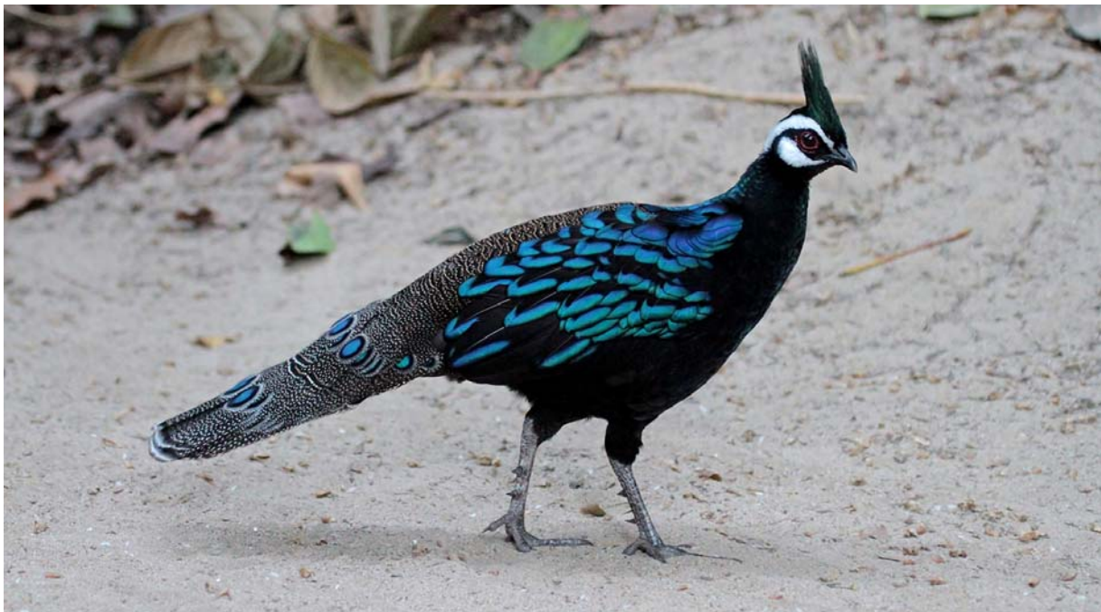
Palawan Peacock Pheasant, St. Paul's, Palawan