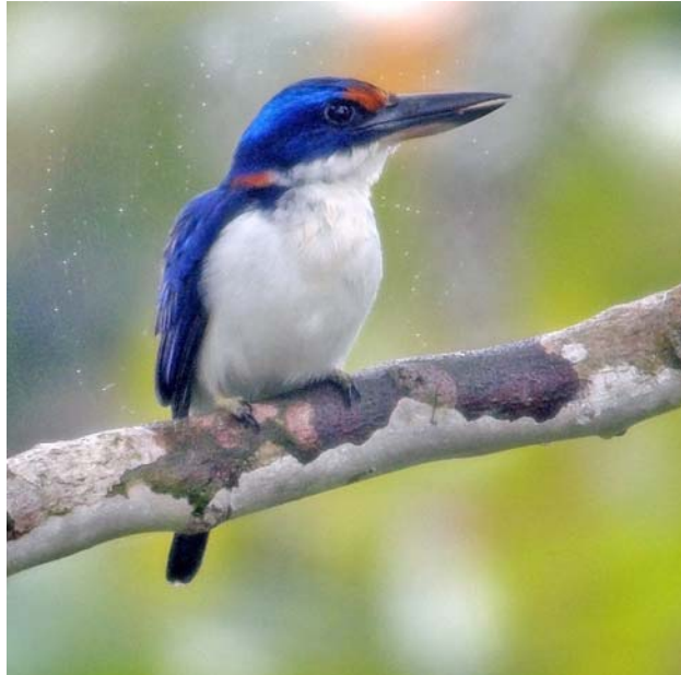
Steere's Pitta and Rufous-lored Kingfisher, PICOP, Mindanao

Our second day covered the same areas but new birds continued to appear; we began in style with a family of Rufous Hornbills, another stunning Azure-breasted Pitta and the Short-crested Monarch of the previous day finally performed beautifully. Black-headed Tailorbirds were teased from the undergrowth at last, Olive-backed Flowerpecker, Philippine Cuckoo Dove and Yellowish Bulbul were also new and