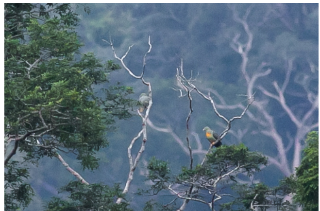
White-bellied Woodpecker and Large Green Pigeon

Having seen the family of Peacock-Pheasants, we set our sights to the steamy lowlands of Taman Negara. We arrived at the resort at midday and were lucky to have a fruiting tree next to the restaurant. Bulbuls, namely Streaked, Buff-vented, Red-eyed and Stripe-throated frequented it. A Yellow-crowned Barbet joined the feast, more often heard in the canopy than seen, as was a pair of Greater Green Leafbirds, a species less frequently encountered in other parts of its range due to the rampant pet bird industry that has obliterated the population of this species. A walk along the trails brought the endangered Straw-headed Bulbul, Banded Woodpecker and Chestnut-breasted Malkoha. Thereafter, we spent some time in the nearby hide and this proved fruitful with sightings of a pair of Large Green Pigeons, a flock of its smaller cousin Thick-billed Green Pigeon, a single foraging Puff-backed Bulbul, flyby Great Slaty Woodpeckers and a family of cute Black-thighed Falconets. Returning to the resort, we had a male White-bellied Woodpecker working a dead tree trunk and a pair of Rufous Woodpeckers foraging nearby. We headed for dinner shortly but a thunderstorm prevented us from a night birding foray.