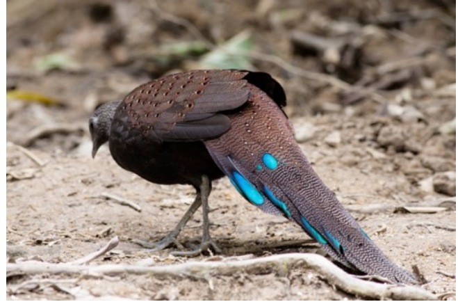
Juvenile, Female and Male Mountain Peacock-Pheasants