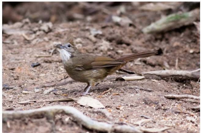
Pale Blue Flycatcher and Ochraceous Bulbul