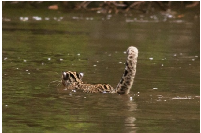
Common Hill Myna and Marbled Cat