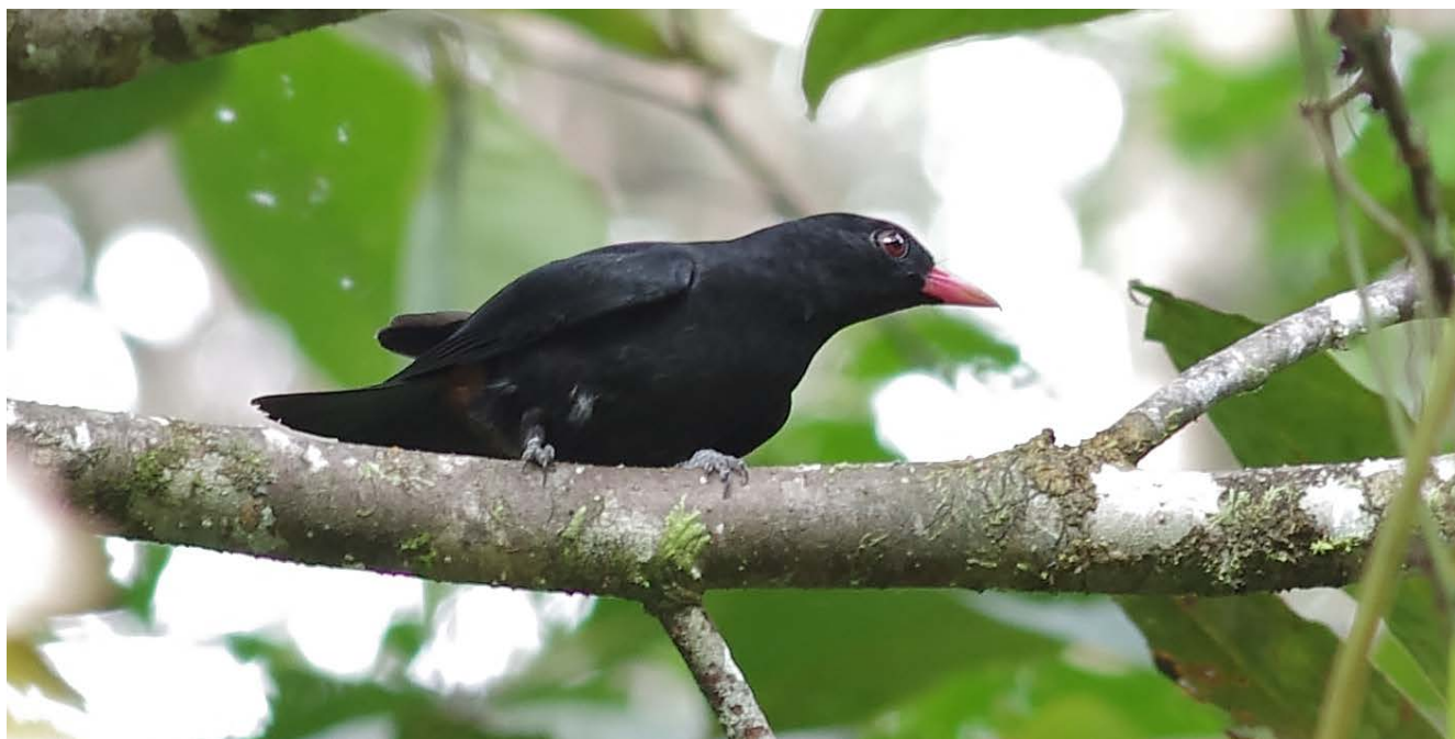
Black Oriole, Sarawak