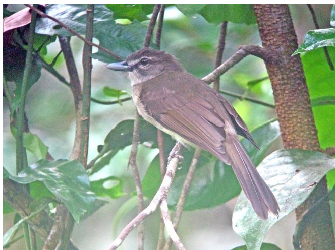
Hook-billed Bulbul

Heavy overnight rain had stopped by the time we set foot on the trail at dawn the following day, but the aftermath was that we spent the day wading up a shallow stream rather than the hoped-for gentle stroll up a grassy trail! Our first rest stop brought us under a fruiting tree which teemed with birds. Pygmy and Everett's White-eyes intermingled in a frenetic fizz of activity, and at least seven Blue-and-white Flycatchers and a single Mugimaki Flycatcher hovered and sallied in their midst. As we ascended, Ruddy Cuckoo Doves flew overhead, and a Hill Blue Flycatcher of the distinctive Bornean endemic race sang quietly from a trailside perch. Wreathed and Rhinoceros Hornbills and Oriental Honey Buzzards passed overhead before we reached the camp. After lunch we ascended higher, and soon connected with a pair of Black Orioles, which called and then sang animatedly, much to our delight. A calling Rail Babbler then drew our attention, but after giving a brief view to Mike, it remained obstinately out of sight. At dusk we tried hard to locate Bornean Frogmouth, but were rewarded only with two distant and intermittently calling birds.