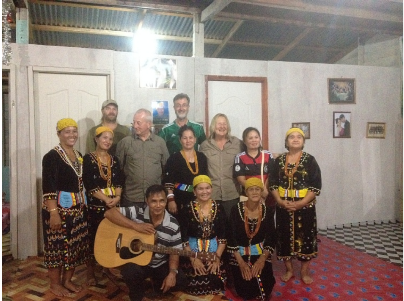
Black Oriole welcoming committee!