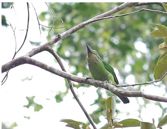
Jentink's Squirrel and Mountain Barbet