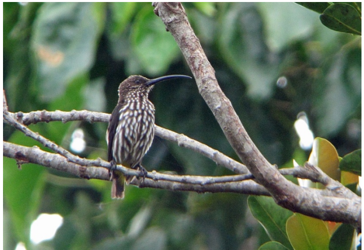
Bornean Barbet and Whitehead's Spiderhunter